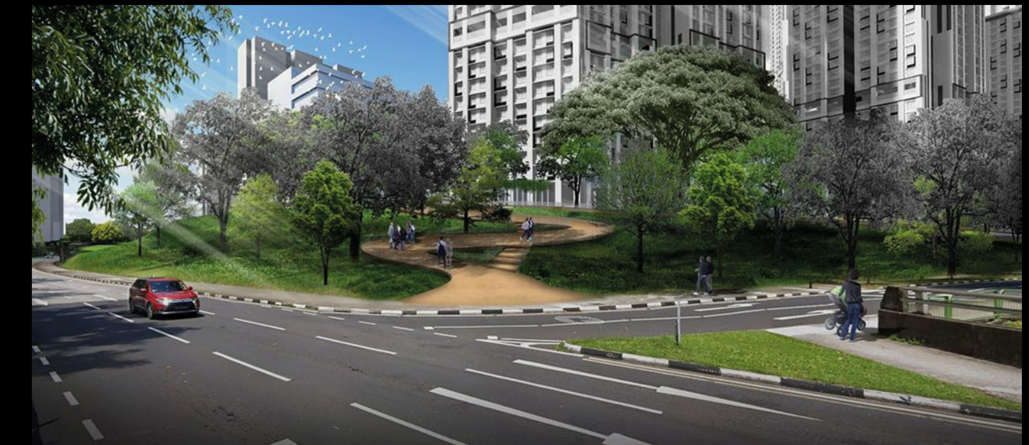
The Canopy Walk features boardwalks that navigate through the undulating site terrain