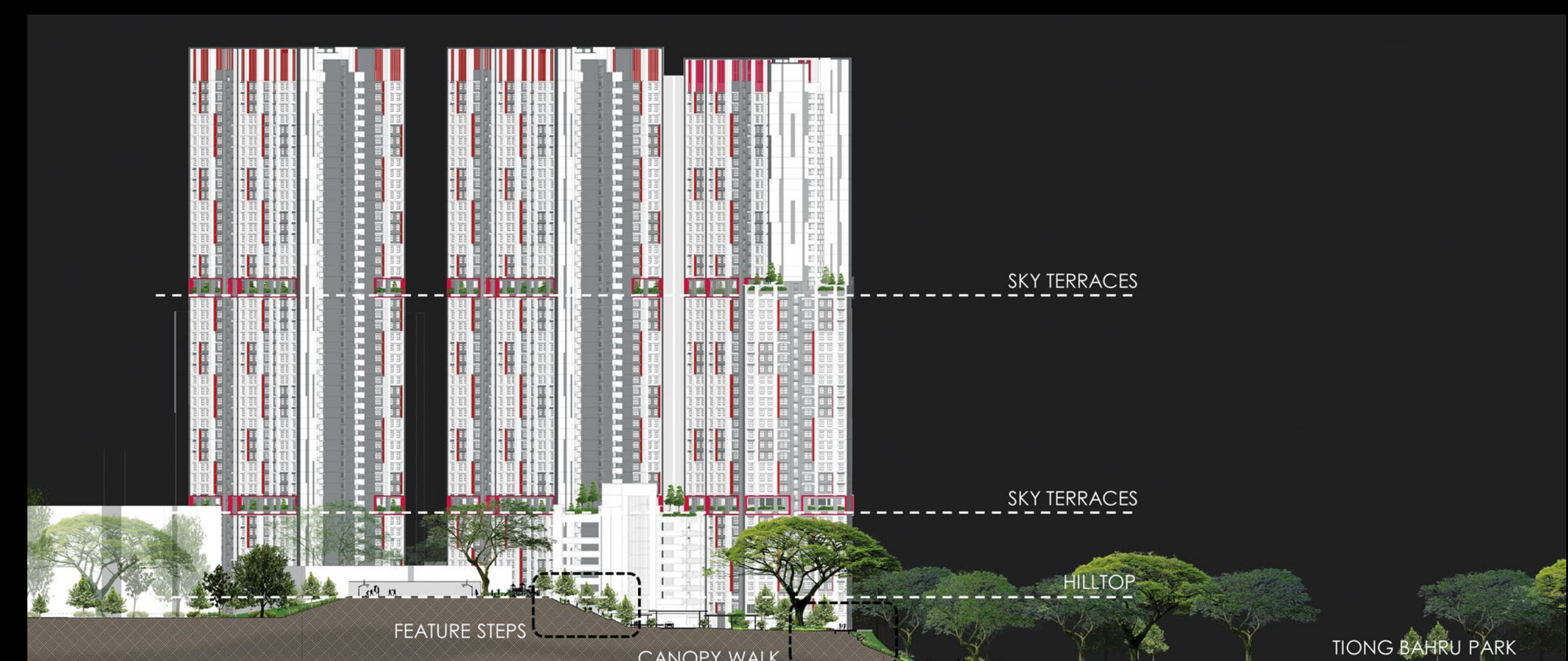
Cross section featuring the canopy walk and precinct hilltop, and social spaces high up in the residential blocks