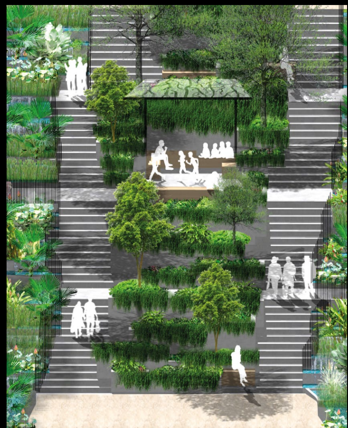
Feature steps integrated with greenery and social spaces for residents to interact