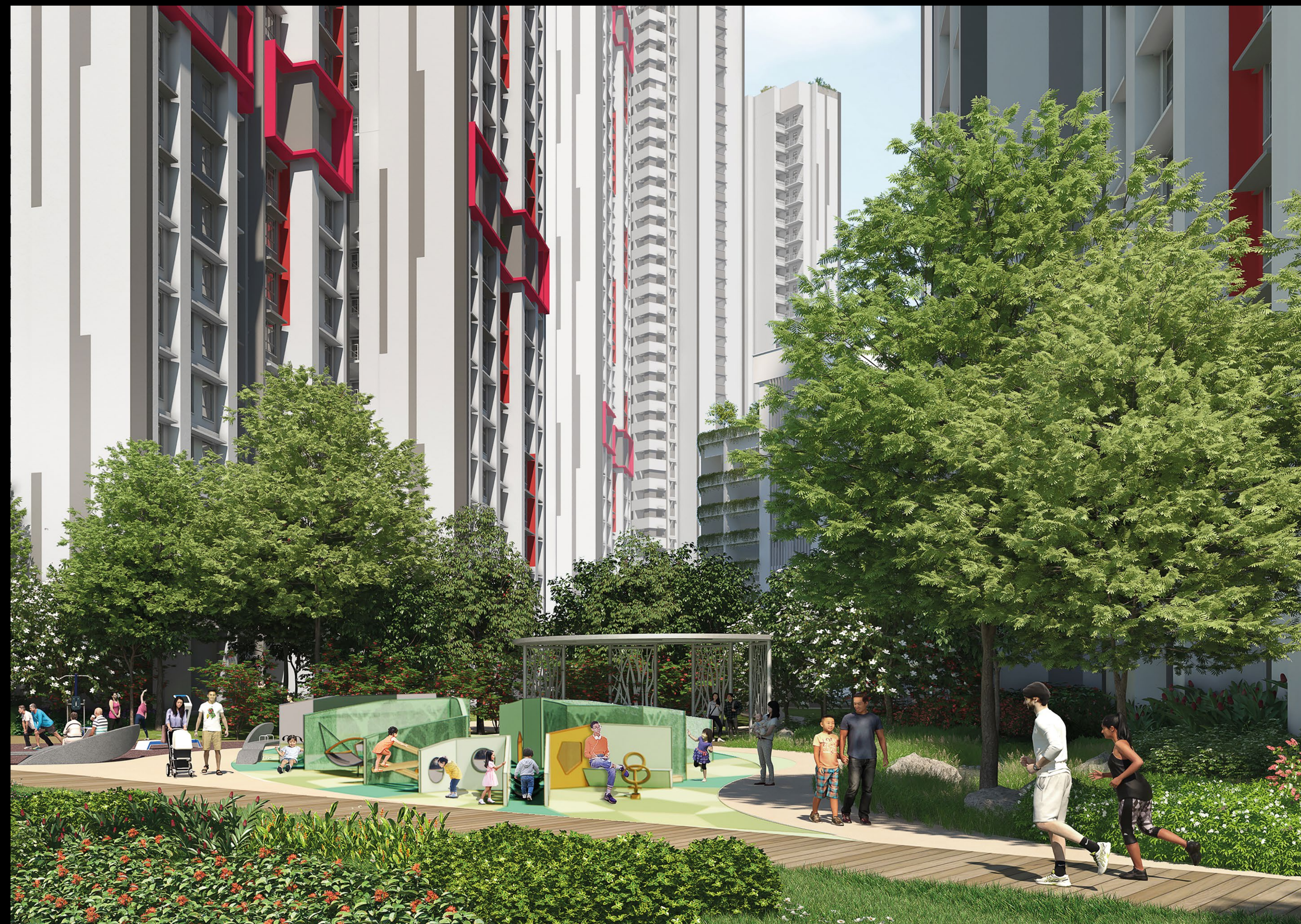
Multi-generational playground and fitness cluster along Henderson Road